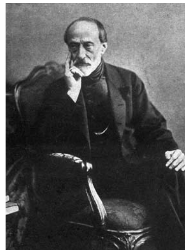
Giuseppe Mazzini (1805-1872)