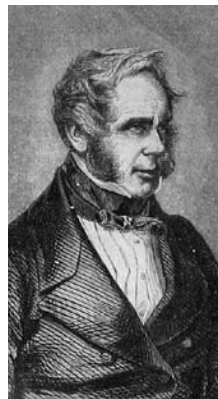
Lord Palmerston (1784-1865)