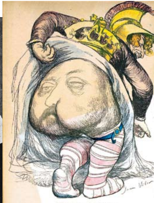
King Edward VII (formerly Prince of Wales Edward Albert) used British imperial policy to prepare the way for World War I and Japan's wars against China—both intended to destroy any nation-state that could challenge the power of the British Empire. Above: A French view of Edward, "Shameless Albion" (Jean Veber, 1901).

general breakdown-crisis of the entire world monetary and physical-economic systems. If that physical-economic situation were not to be turned around—verysoon—theperiod following the November 4, 2008 U.S. general election could be the clarion for the collapse of the economies of all nations of the planet of a type similar to, but far, far worse than that which Europe experienced during that Fourteenth-Century New Dark Age, a New Dark Age during which the number of parishes of Europe shrank by half, the population of Europe was quickly reduced by one third, and the Black Death was the characteristic cultural feature of the decades following the official bankruptcy of the King of England. 1 This time, if that dark age looming on your doorstep is actually unleashed, the result will be one far, far worse than what happened to Europe during