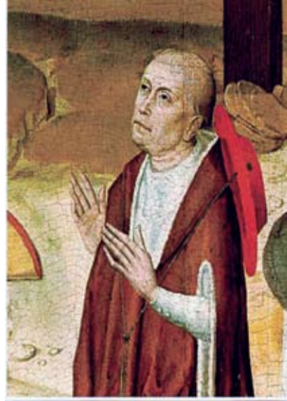
Cardinal Nicholas of Cusa (1401-1464)

ish Liberal system. That trans-Atlantic struggle, centered in opposing, English-speaking cultures, a struggle for true human freedom against the Anglo-Dutch Liberal form of neo-Venetian imperialism, is the struggle which has been the principal pivot of world history under this arrangement, to the present day.