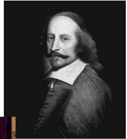
Cardinal Jules Mazarin (1602-1661)

Prior to the Peace of Westphalia, partial victories in the cause of creating sovereign nation-states were achieved thanks to the efforts of Nicholas of Cusa; in the 17th Century, Cardinal Mazarin and his associate Jean-Baptiste Colbert developed the ecumenical principle for relations among sovereigns that ended the Thirty Years War, with the Peace of Westphalia in 1648.