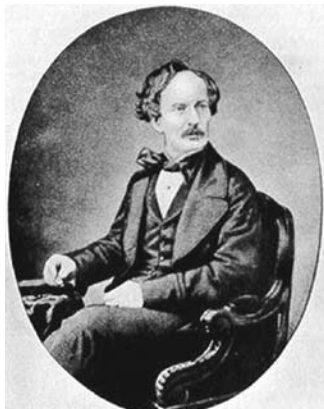
David Urquhart (1805-1877)