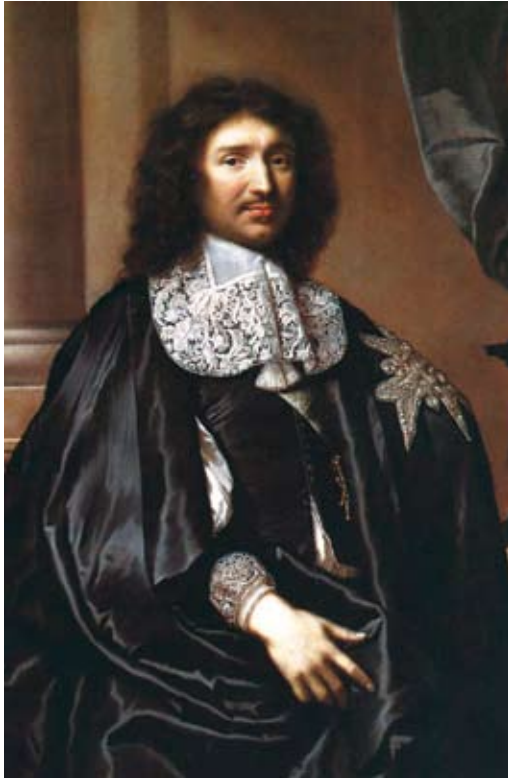
Jean-Baptiste Colbert (1619-1683)

Prior to the Peace of Westphalia, partial victories in the cause of creating sovereign nation-states were achieved thanks to the efforts of Nicholas of Cusa; in the 17th Century, Cardinal Mazarin and his associate Jean-Baptiste Colbert developed the ecumenical principle for relations among sovereigns that ended the Thirty Years War, with the Peace of Westphalia in 1648.