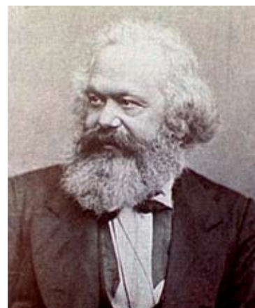
Karl Marx (1818-1883)