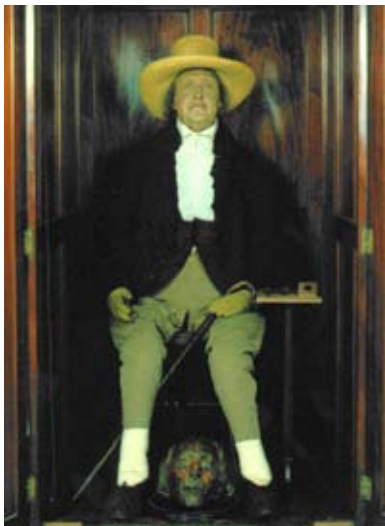
Jeremy Bentham (stuffed) (1748-1832)

For that purpose, the roots of the principal causes of crises of the planet during 1945-2008, must be situated within what is a fresh, corrected view of the profound change in the relations of the U.S.A. and Soviet Union, from those during the time the foe of British imperialism, President Franklin Roosevelt, led the United States, while he lived, into the opposite direction of relations which were defined in a different direction, under his successor, the President Harry Truman who was a supporter of British and related European colonialism. This change, from Roosevelt to Truman, produced the radically changed U.S. direction in foreign and also domestic relations which we experienced under Truman, and, much worse, under Presidents