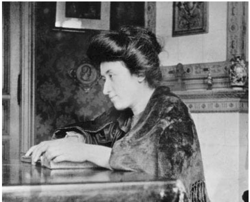
The Polish-German socialist Rosa Luxemburg (ca. 1870-1919) grasped the nature of modern imperialism in a way that V.I. Lenin, for example, did not.

However, it was not until the U.S. State Department