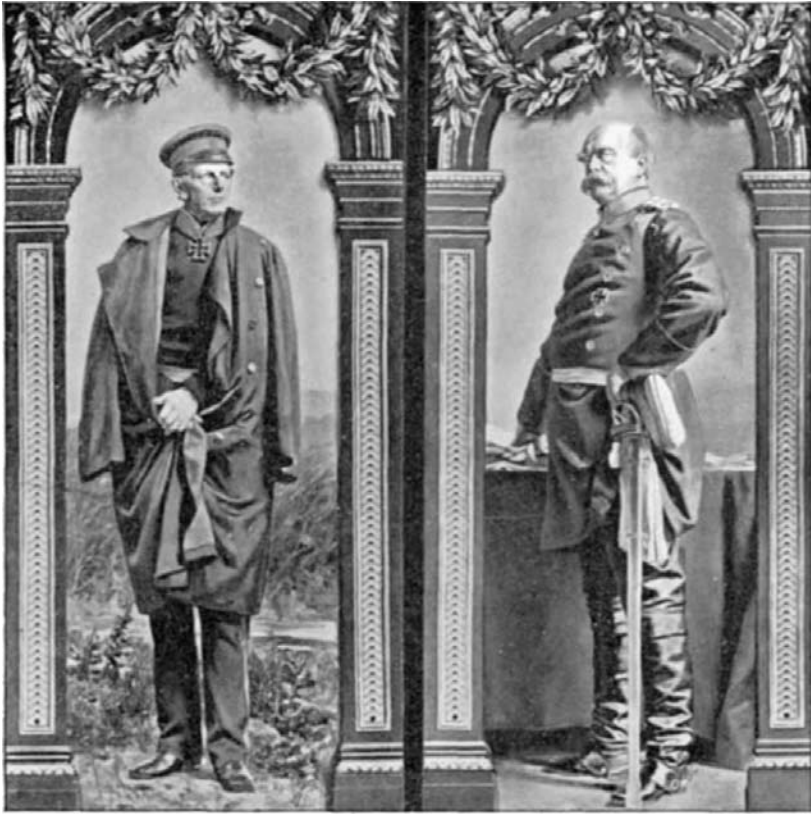
Prussian Chancellor Otto von Bismarck (right), shown here with the talented Field Marshal Helmut von Moltke. Bismarck, who was implementing economic reforms on the model of the American System, was ousted in 1890 on orders from London's King Edward VII. He warned that London's maneuvers would lead to general war, as they did in 1914.

empire depended, became the so-called “geopolitical” issue around which the British Empire has repeatedly launched general warfare ever since, especially since the Prince of Wales succeeded in prompting the ejection of Chancellor Bismarck in 1890. Essentially, all important warfare on this planet since those times, has been an expression of the model of the so-called “geopolitical” conflict between the American republican and the British imperialist models of society.