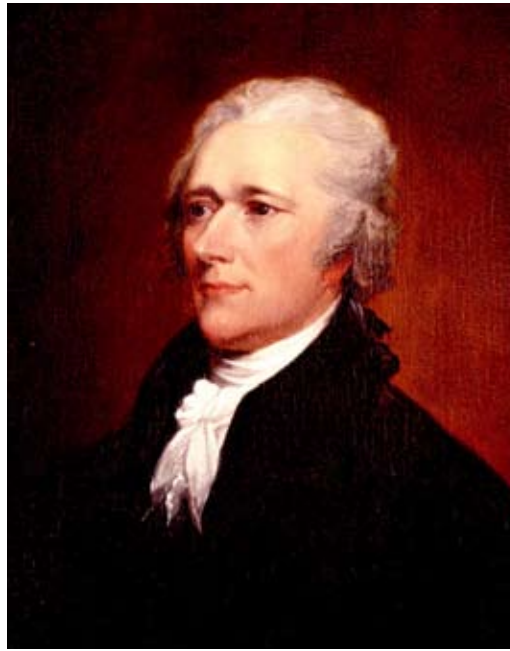
The remedy for a superstitious belief in something called "capitalism" is to be found in, for example, the work of U.S. Treasury Secretary Alexander Hamilton. The constitutional principle upon which the United States was founded was a repudiation of British imperial empiricism (which both Adam Smith and Karl Marx viewed as "capitalism").

In stark contrast to British imperial empiricism, the idea of the existence of "capitalism," as distinct from the constitutional intention of of such United States Presidents as Washington, Lincoln, and Franklin Roosevelt, exists only as a curious variety of Anglo-Dutch Liberal, pagan religious belief. (Hence an inevitable, inherently systemic conflict between what is called capitalism and Christianity, for example.) Happily, the