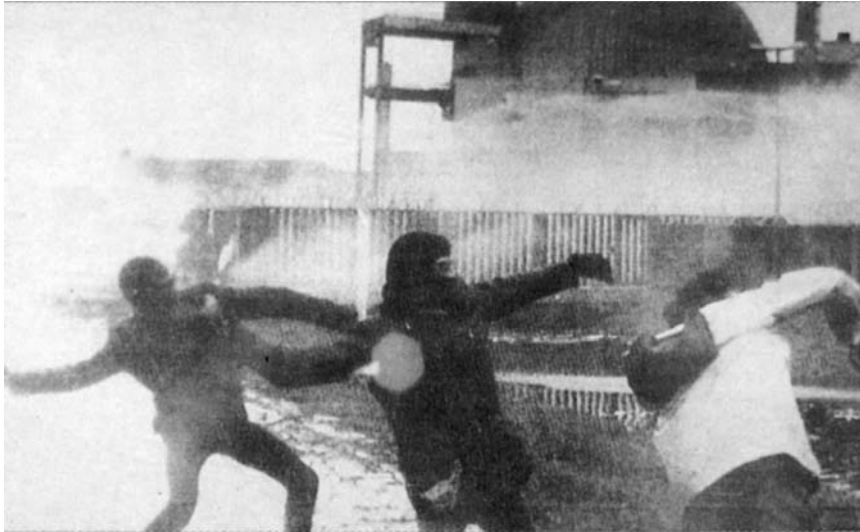
German terrorist cousins of the Weathermen assault a nuclear plant in Germany, 1986. The rioting came close to the level of outright civil war, and shifted the nation into a “green” worldview that led to the ban on all new nuclear plants, and the phaseout of existing ones. That ban remains in effect today.

Mussolini in a staged exhibition of Sorelian “purgative violence.” Look behind the Weatherman fascist cult to the offices where it finds homes today, to see where the danger to our republic lies simmering, now.